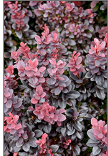
Concorde Japanese Barberry foliage

Concorde Japanese Barberry is recommended for the following landscape applications;