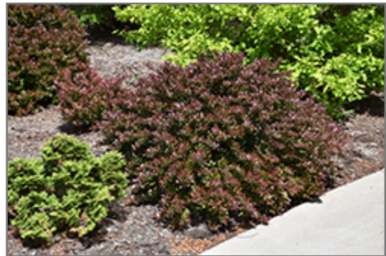
Concorde Japanese Barberry Photo courtesy of NetPS Plant Finder