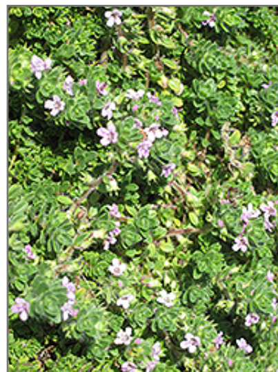
Pink Chintz Creeping Thyme flowers